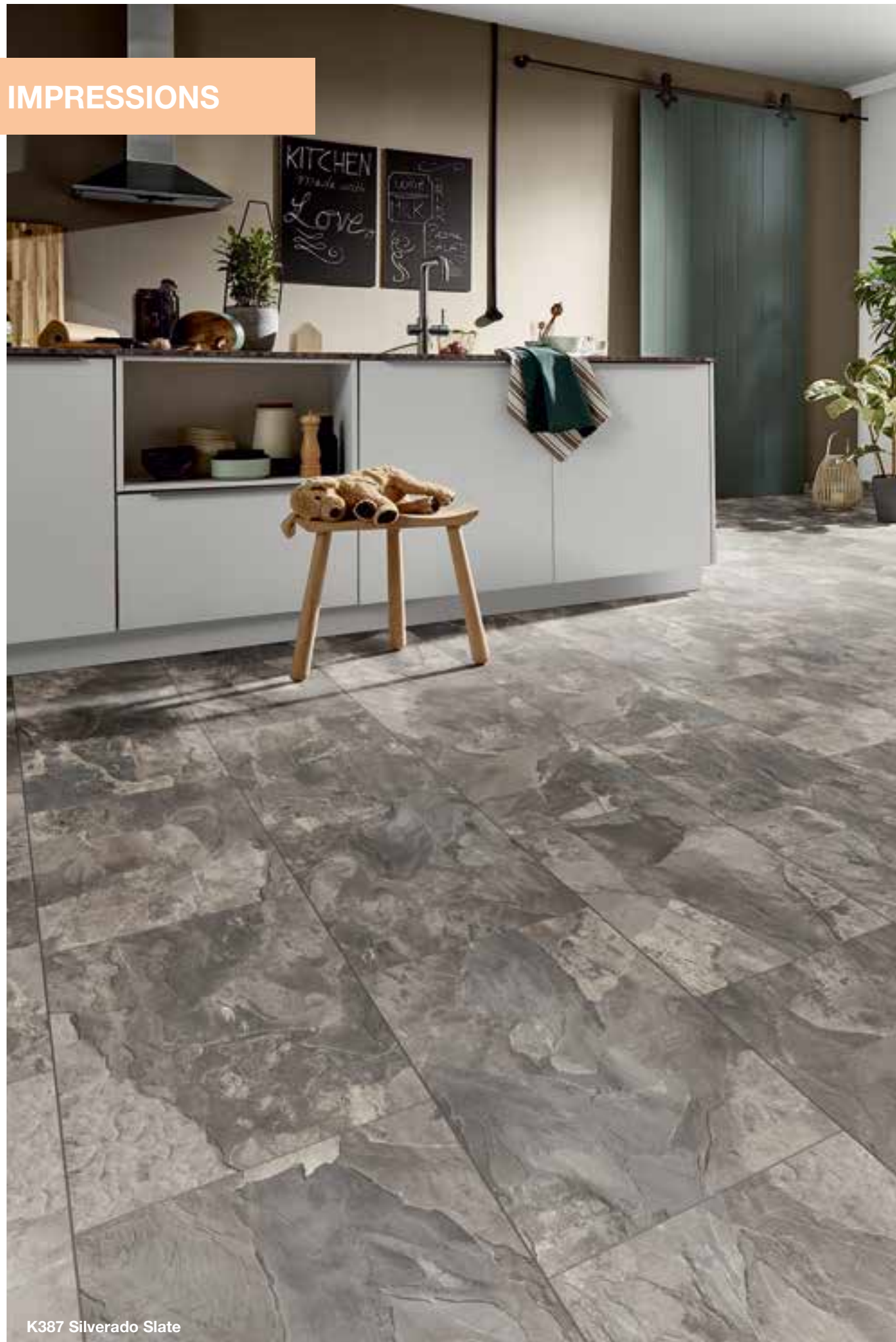
K387 Silverado Slate