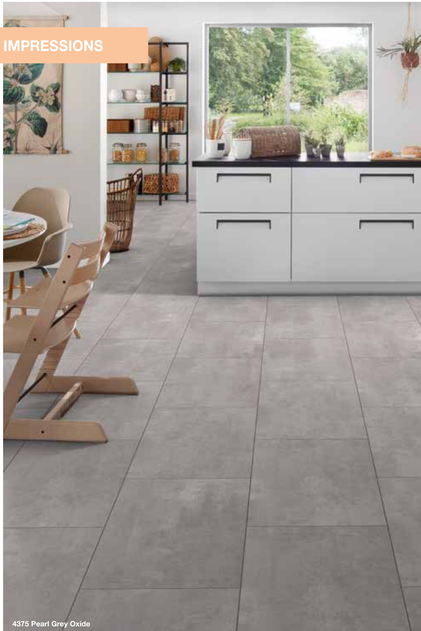
4375 Pearl Grey Oxide