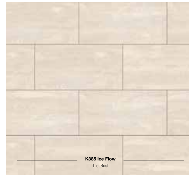
K385 Ice Flow Tile, Rust