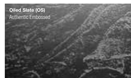
Oiled Slate (OS) Authentic Embossed