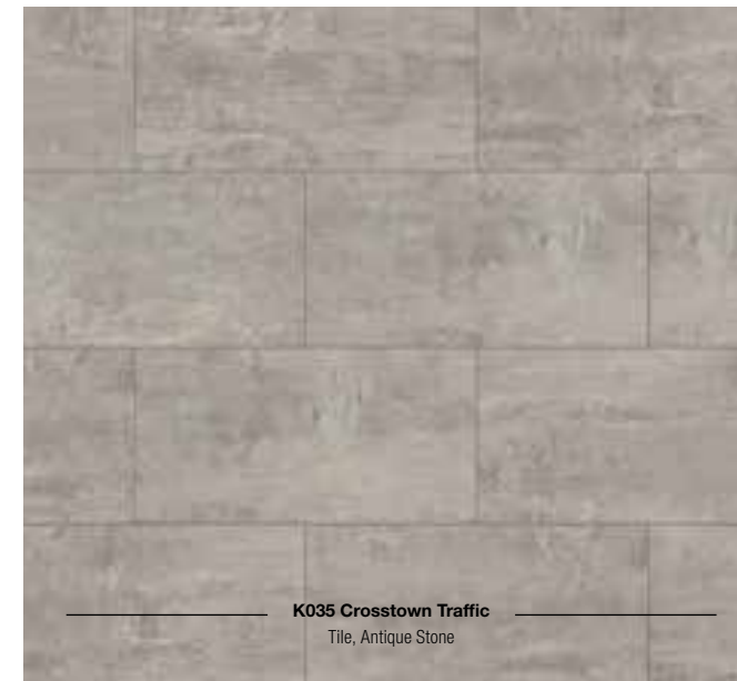
K035 Crosstown Traffic Tile, Antique Stone