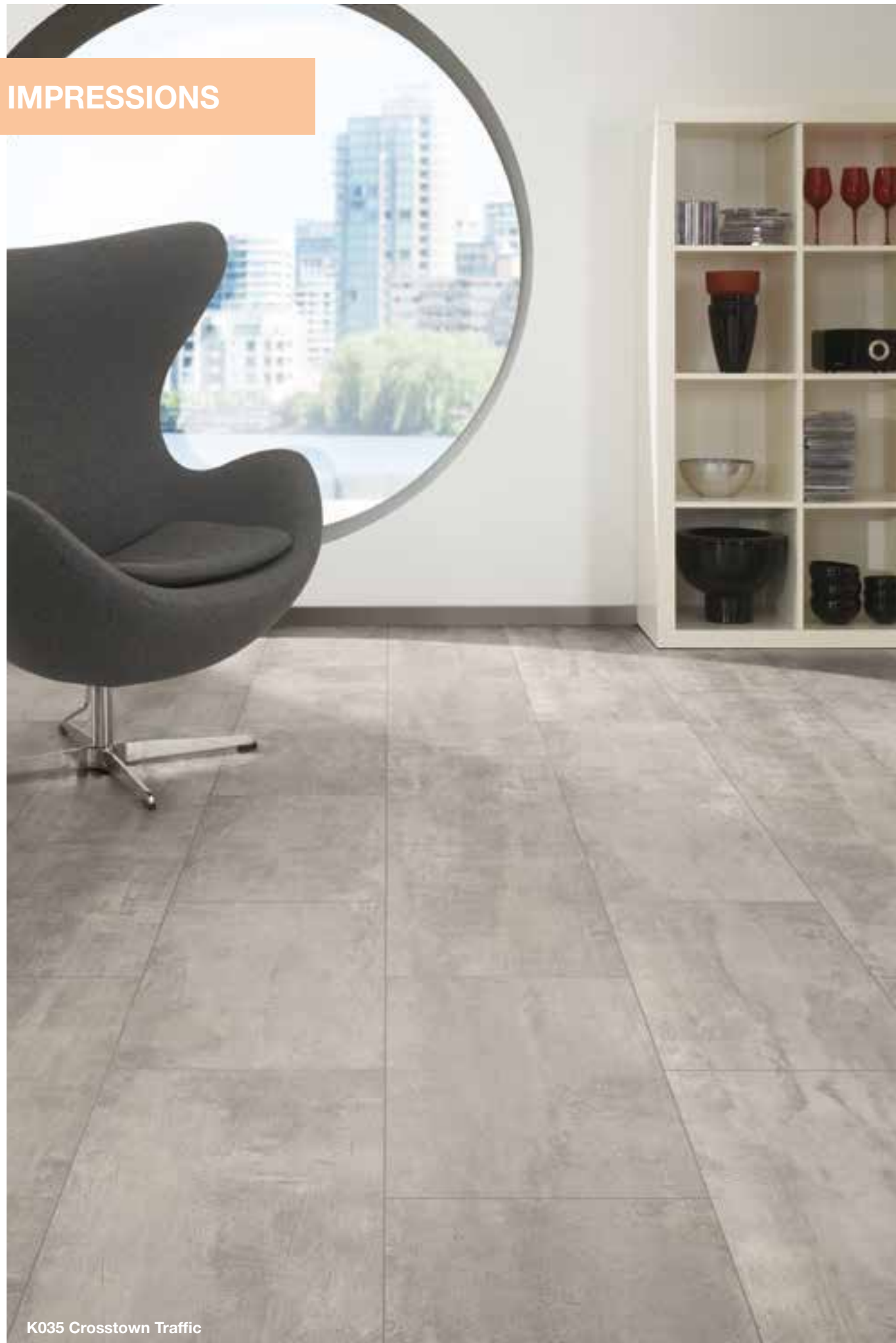
K035 Crosstown Traffic