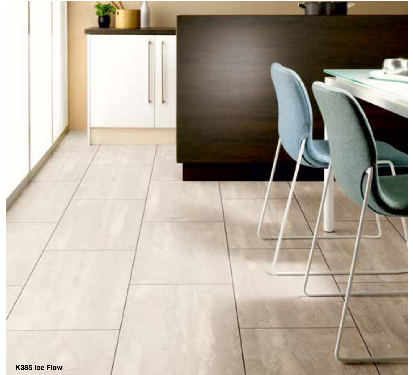
K385 Ice Flow