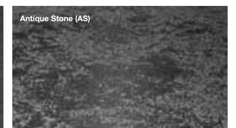
Antique Stone (AS)